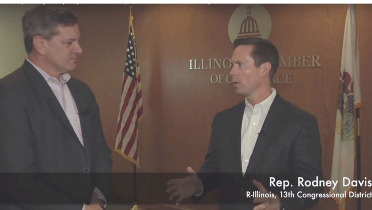
Rep. Rodney Davis R-Illinois, 13th Congressional District